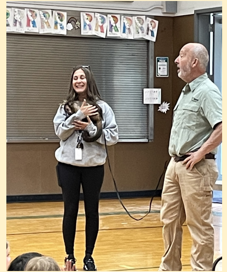
TK-2 Wild Things Assembly