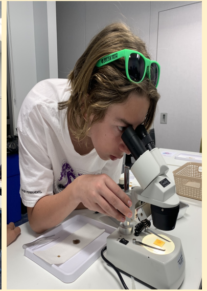
7th Grade field trip to the Sacramento Museum of Science and Curiosity